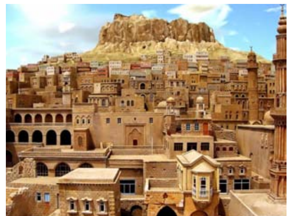
Left: Kurdish Castle of Hosap, Güzelsu , Ancient city of Hasankeyf, Armenian Church of the Holy Cross, Akdamar Island Right: Mt Ararat, Ruined Armenian City of Ani, Midyat, Mardin