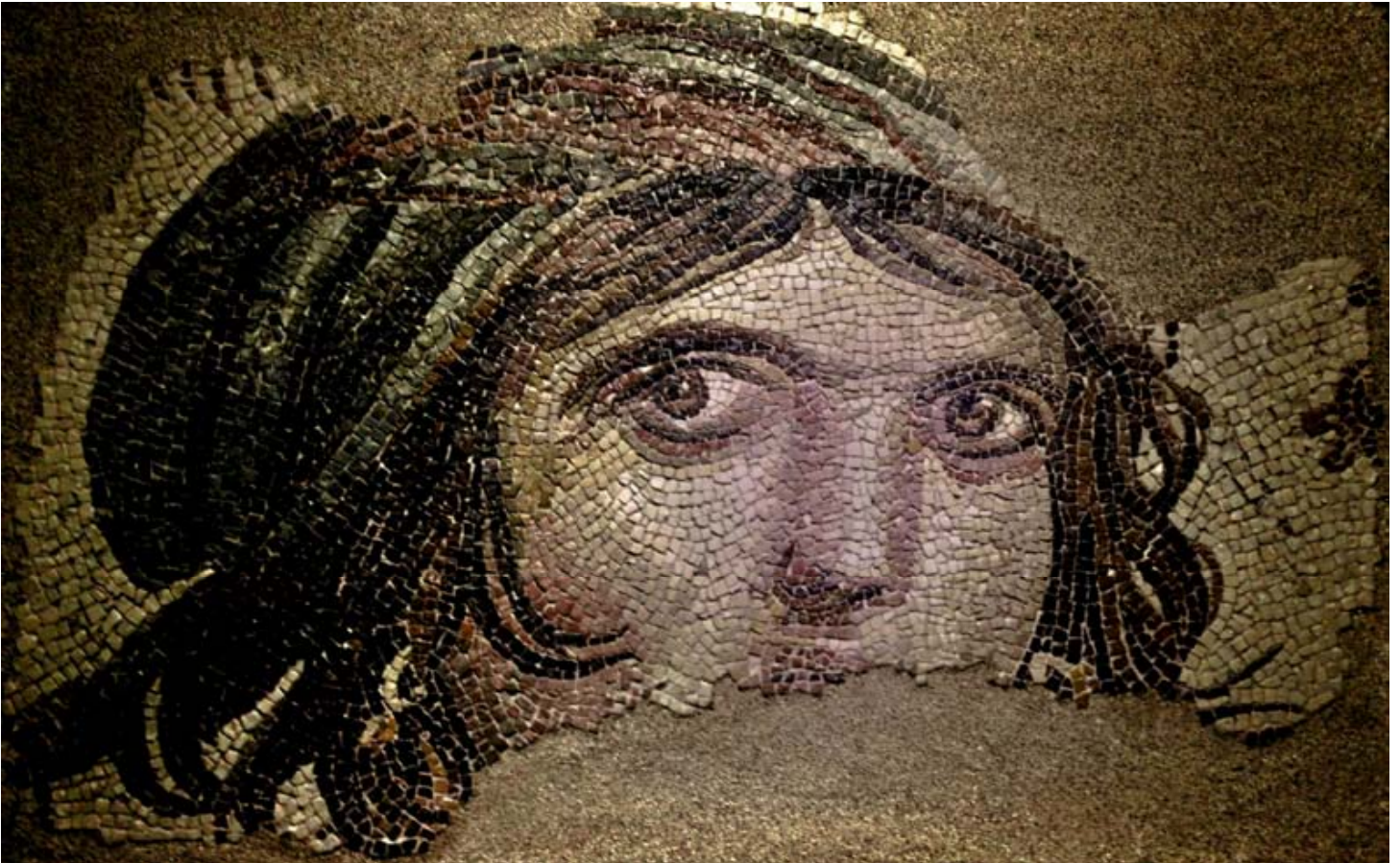
Gypsy Girl Mosaic, Zeugma Mosaic Museum, Gaziantep