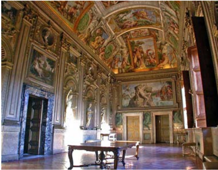
Interior Palazzo Farnese, Rome