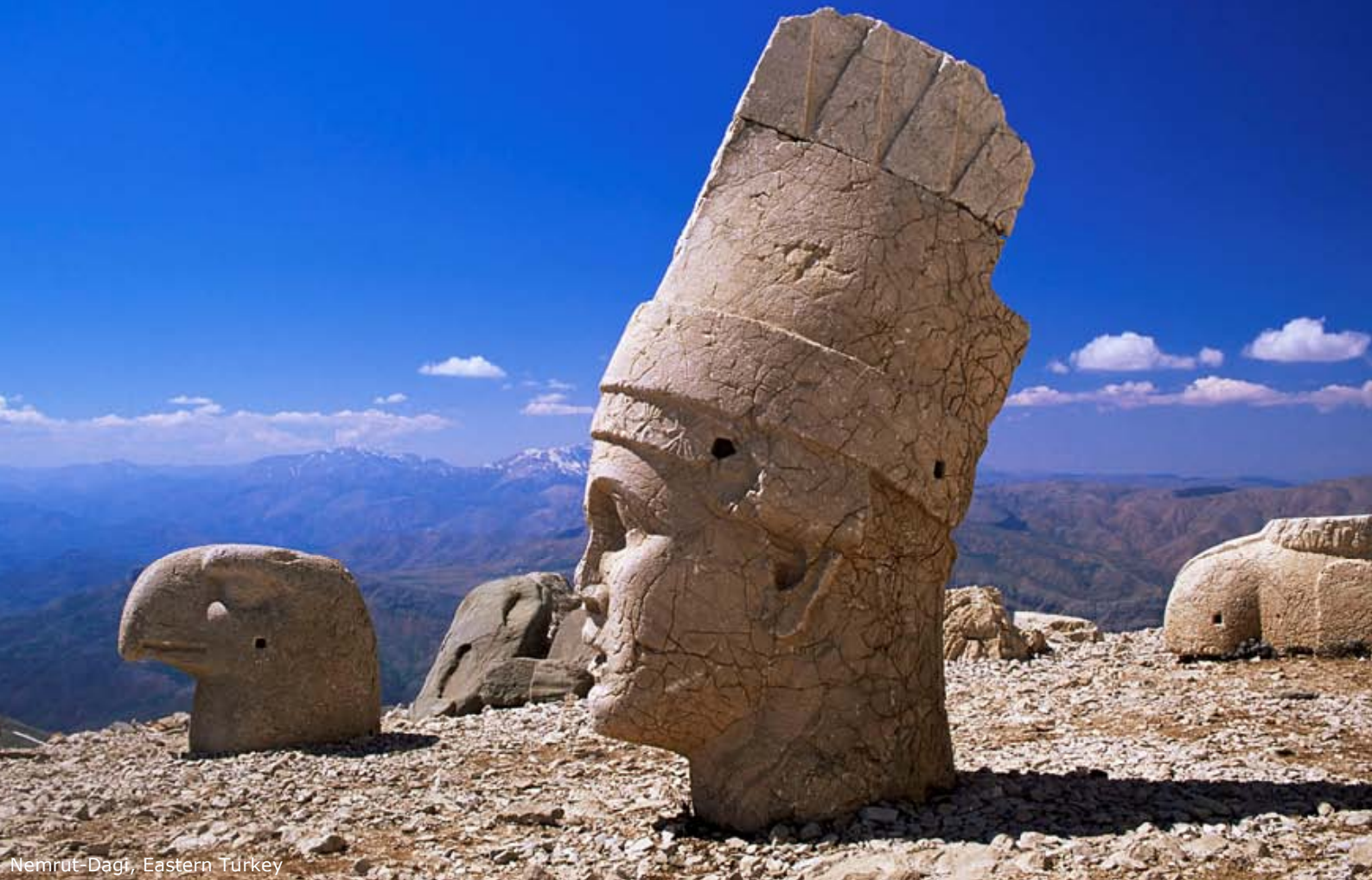
Nemrut-Dagi, Eastern Turkey

ARCHITECTURE ARCHAEOLOGY ART HISTORY CULTURE HORTICULTURE LANDSCAPE ARCHITECTURE GARDEN HISTORY