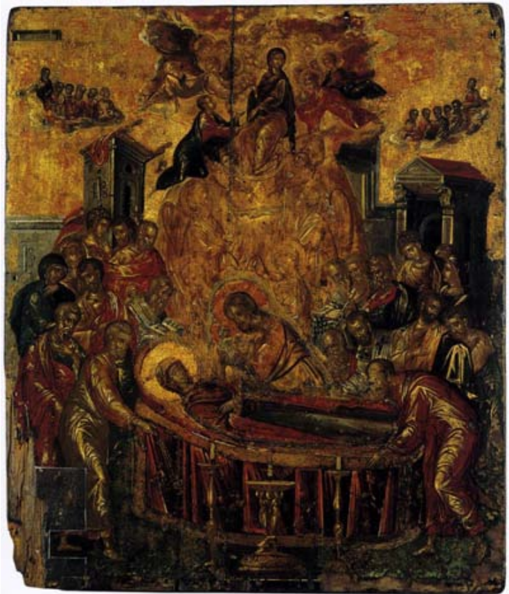
Dormition of the Virgin

Around 1568, while in his mid-20's, El Greco left Crete, never to return, for Venice, where he made an even more remarkable intellectual journey as an artist: from medieval Byzantium to Renaissance Italy. During 10 years in Venice and, more briefly, Rome, he abandoned wooden boards and tempera for canvas and oils. He adopted the fashionable 'Mannerist' style with its elongated figures and artificial poses. In terms of technique, El Greco became a Venetian painter, learning from Titian's colours and Tintoretto's lighting. During time spent in Rome, he experienced at first-hand the work of Michelangelo and Raphael.