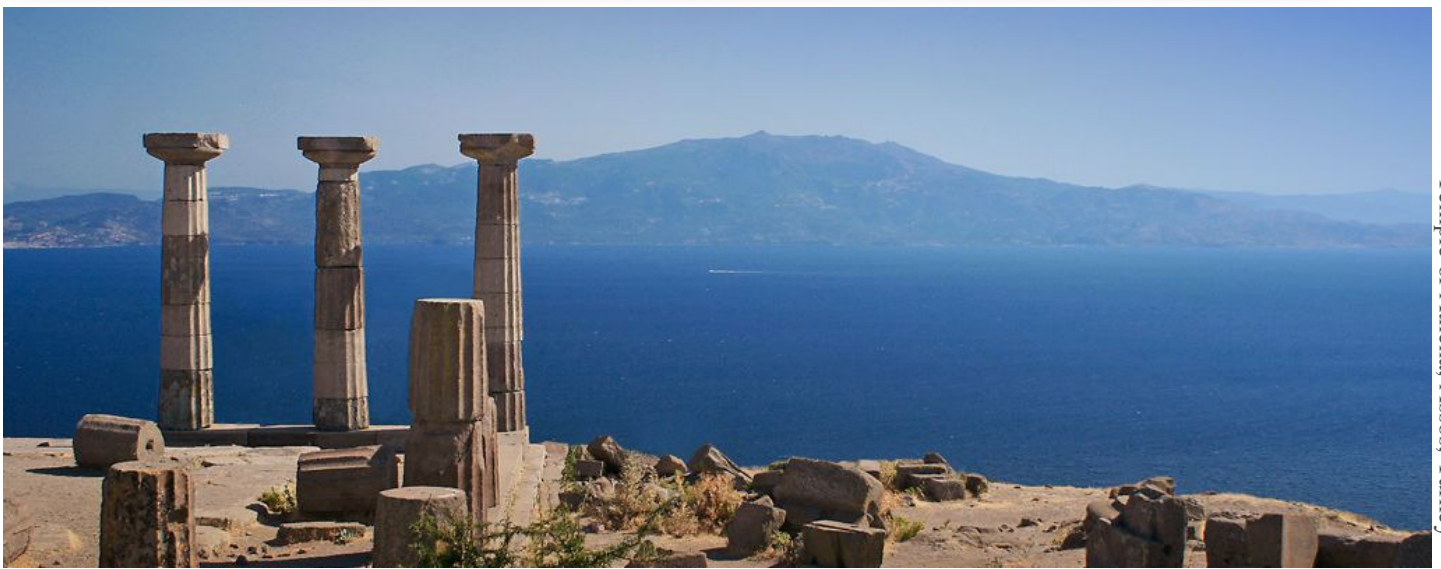
Temple of Athena, Assos, Turkey

12 DAYS Istanbul (4 nights) • Edirne (1 night) • Assos (2 nights) • Bursa (3 nights) • Istanbul (1 night)