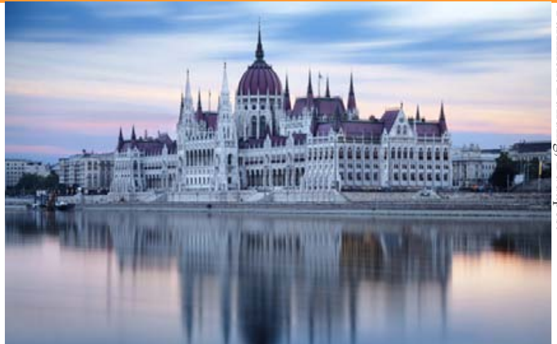
Parliament Building, Budapest