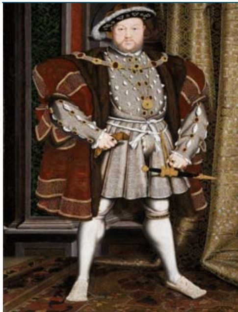
Portrait of Henry VIII Workshop of Hans Holbein the Younger,

This lecture looks at paintings and history through the vehicle of oriental carpets, from German artist, Hans Holbein the Younger's paintings of Henry VIII standing astride an Ottoman carpet, through to nineteenth century paintings by Matisse.