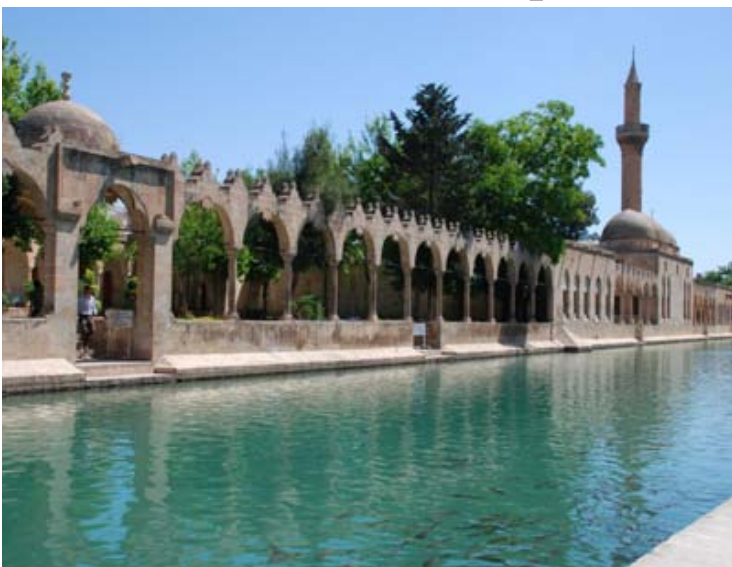
Urfa Balikli Gol