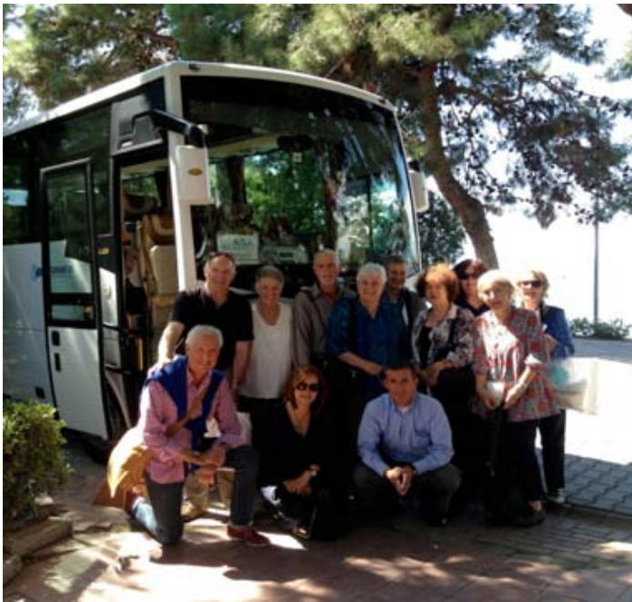
ASA "Ottoman Palaces and Poetry" group on the road, September 2013