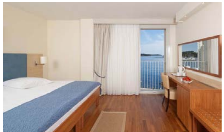
Top: View of the hotel and promenade, Left Outdoor lounge, bar at the hotel. Right: Guest Room, Right Bottom: Floor Mosaic Euphrasian Basilica