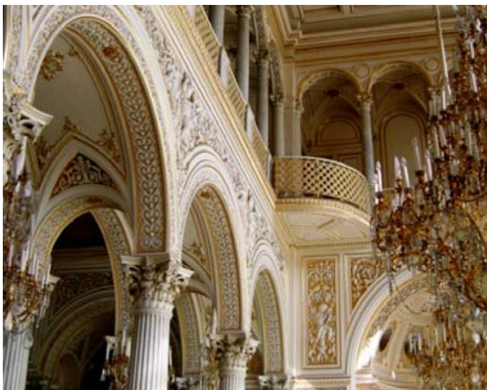
Interior, Hermitage, St Petersburg

We will crisscross Europe from London to Saint Petersburg and Prague to Paris on a grand journey highlighting some of the finest palace museums including the Château de Versailles; the Belvedere, Vienna; and Peterhof, St Petersburg. Kenneth will introduce extraordinary royal collections including the Royal Collection, UK; the Hermitage, St Petersburg; the Prado, Madrid; the Louvre, Paris; and many more.