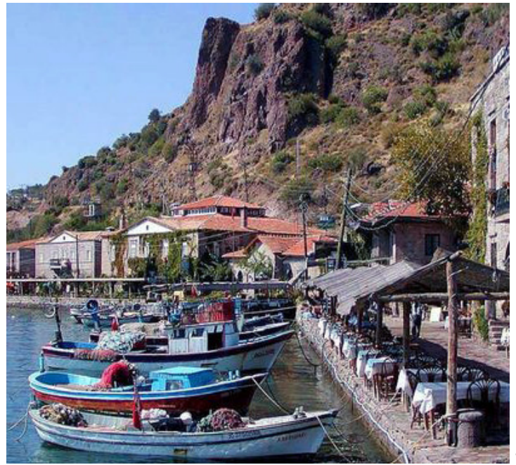
Waterfront, Assos, Turkey