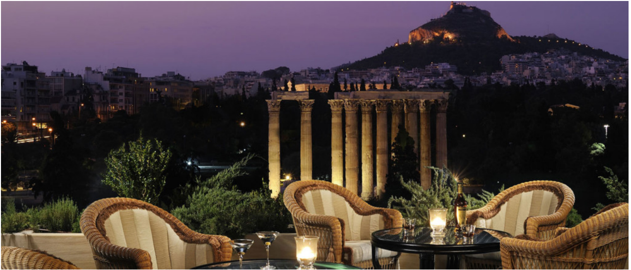
Royal Olympic Hotel, Athens