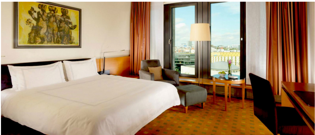
Classic Room, Swissôtel Berlin am Kurfürstendamm.

An elegant 5-star modern hotel located in the heart of west Berlin on the famous Kurfürstendamm shopping boulevard, close to the Kaiser Wilhelm Memorial Church, as well as art galleries, museums and Europe's largest department store – Ka De We. The hotel offers a bar, lounge & restaurant. Rooms are equipped with air-conditioning, en suite bathroom, direct-dial telephone, satellite TV, wireless internet and coffee-maker.