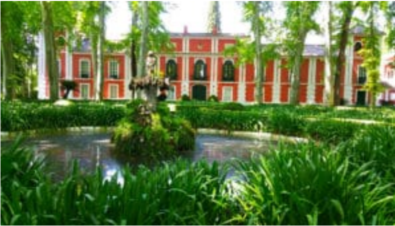
Garden of the Palacio de Moratalla, province of Córdoba[/caption]