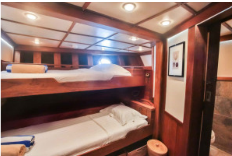
Twin Stateroom, Ombak Putih

At the end of your cruise, you can pay for additional purchases and your bar bill with cash (Indonesian Rupiah or major foreign currency at the current exchange rates) or credit card (Seatrek only accepts VISA).