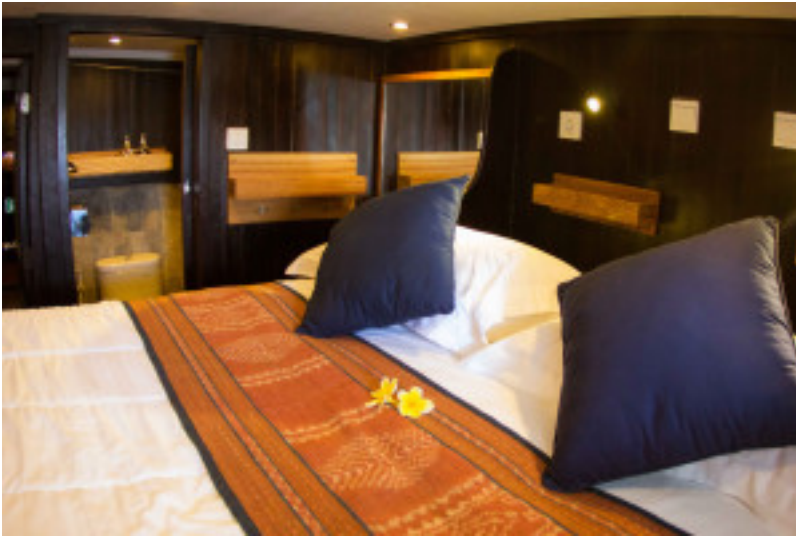
Double Stateroom, Ombak Putih