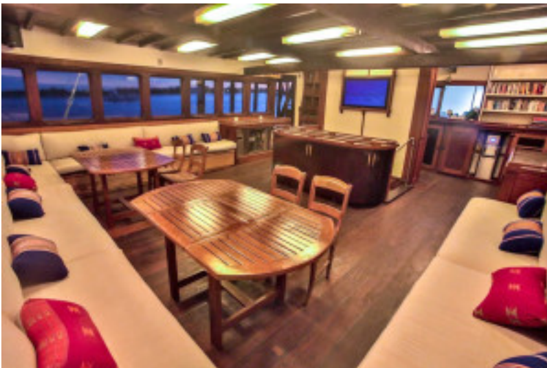
Dining area, Ombak Putih