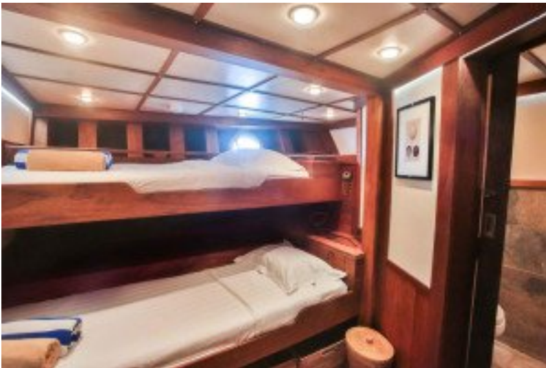
Twin Stateroom, Ombak Putih

At the end of your cruise, you can pay for additional purchases and your bar bill with cash (Indonesian Rupiah or major foreign currency at the current exchange rates) or credit card (Seatrek only accepts VISA).