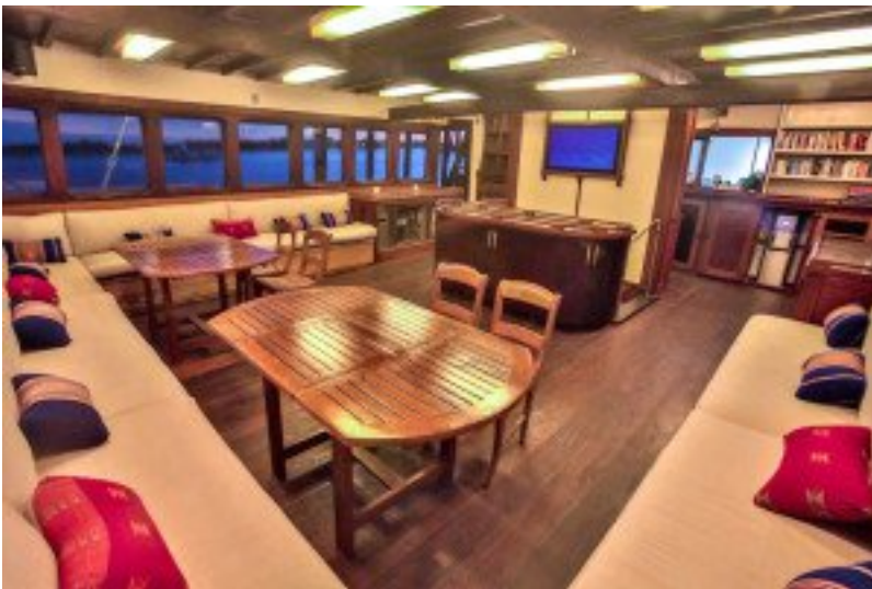
Dining area, Ombak Putih