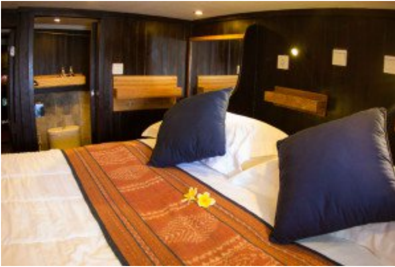
Double Stateroom, Ombak Putih