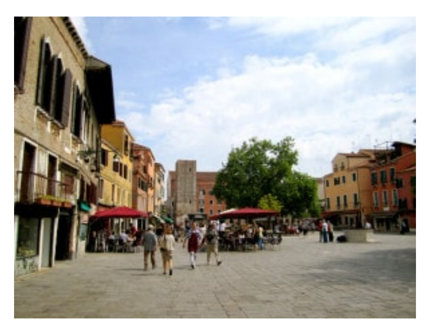
Mix with the locals in Campo Santa Margherita! (4 minutes' walk from NH Rio Novo)

Double rooms for single occupancy may be requested – and are subject to availability and payment of the Single Supplement. The number of rooms available for single occupancy is extremely limited. People wishing to take this supplement are therefore advised to book well in advance.