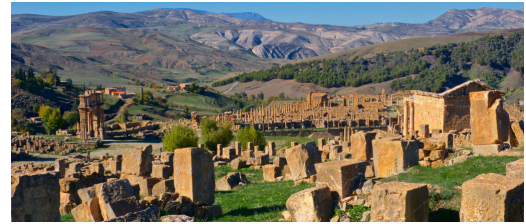
Roman city of Djemila, Setif, Algeria[/caption]

Ancient Algeria, the M'Zab & Saoura Valleys with Iain Shearer 16 April - 6 May 2017 (Waitlisted) & 15 April - 5 May 2018 (Limited)