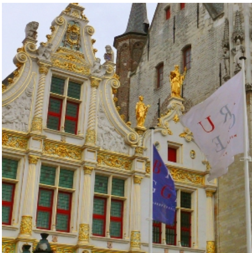
Beyond Chocolate and Windmills:

Cultural Treasures of the Low Countries with John Weretka 8 - 26 September 2016 & 7 - 25 September 2017