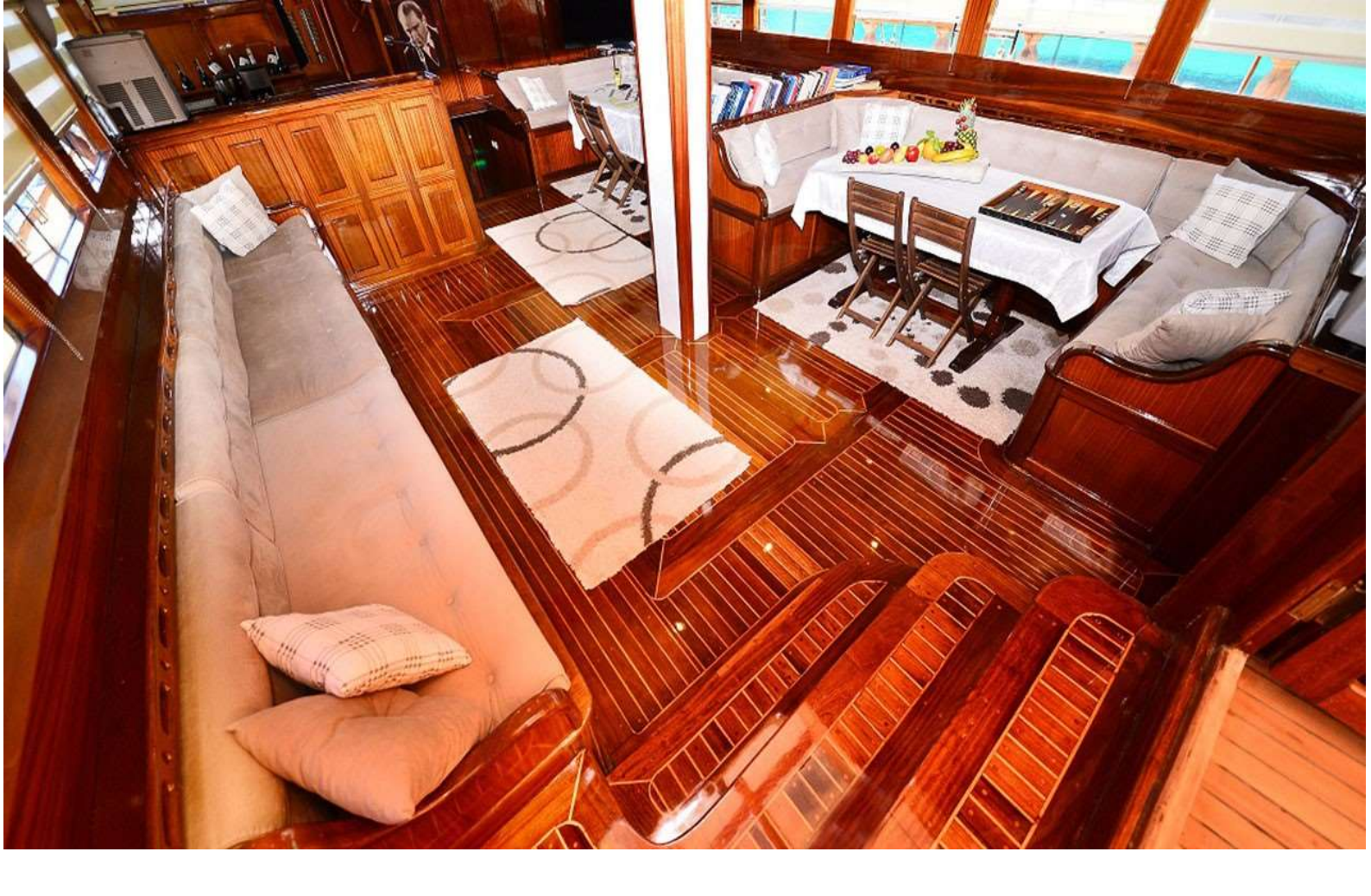
There is a separate dining table in saloon and your meals are prepared in a fully equipped separate kitchen.