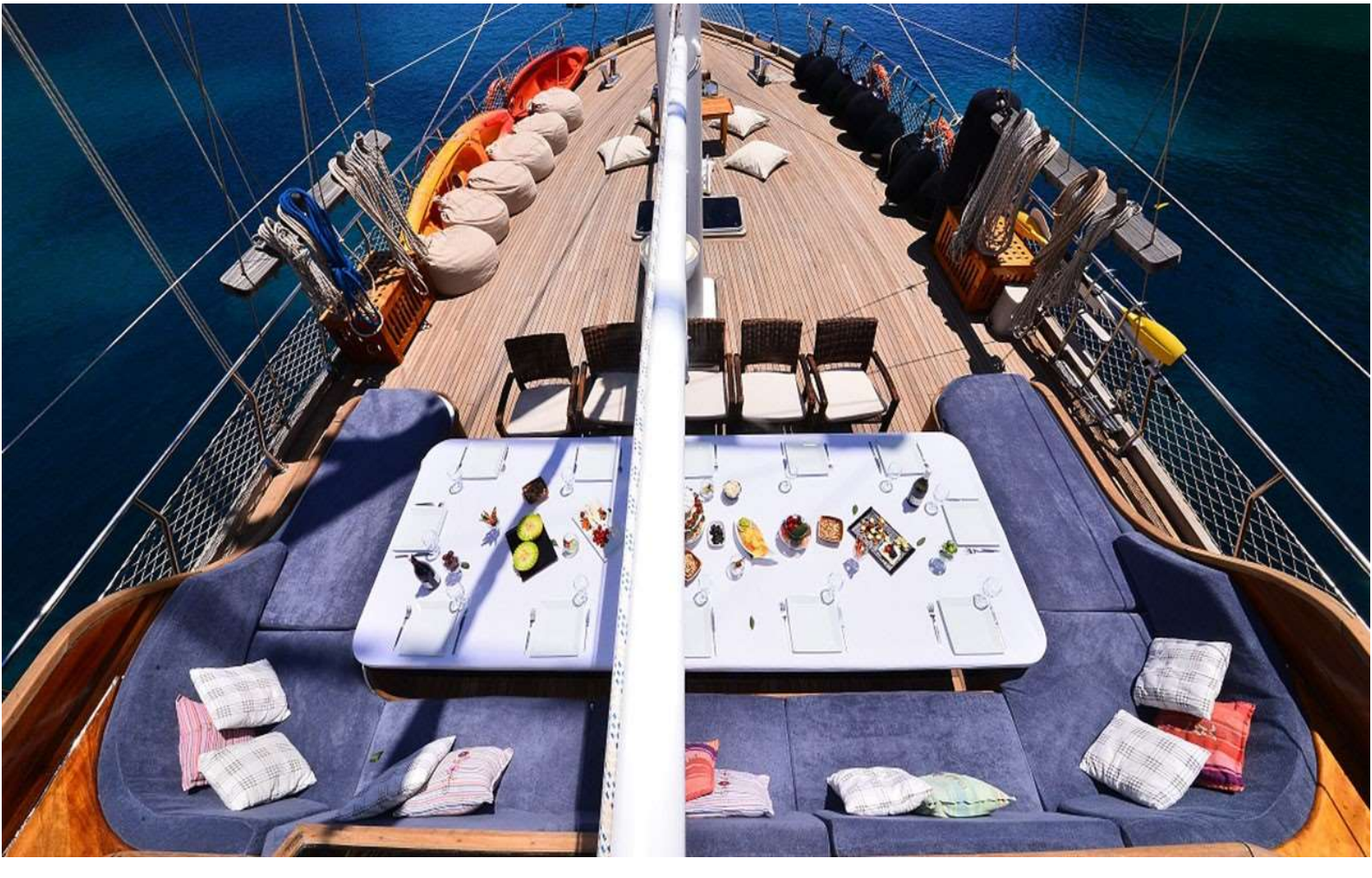
There is a spacious cushioned seating area, dining table and dining area at the rear of the boat.

Ada Deniz Gulet has enough sunbathing mats and space for all guests.