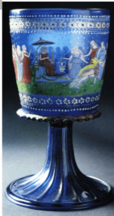
Left and right: Murano glass. Center: Gilt and enameled blown cristallo glass, Venice, late 15th–early 16th century