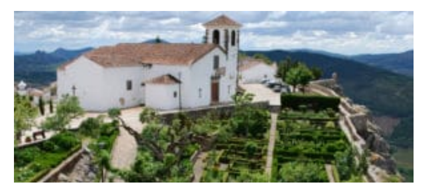
The Pousada de Marvão, Portugal.