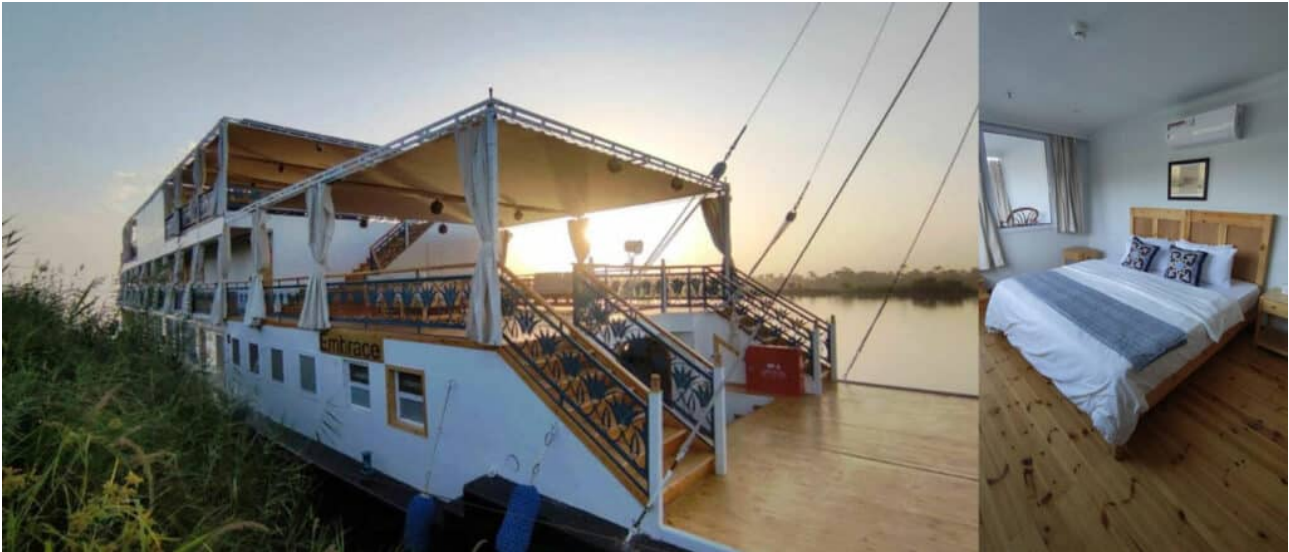
Dahabiya "Embrace", from Luxor to Aswan