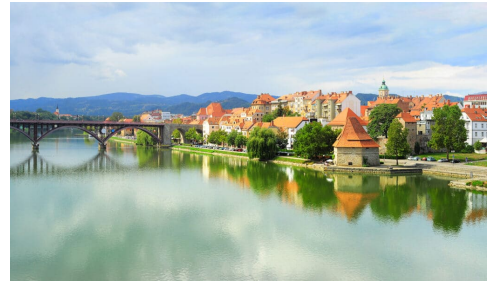
Maribor, Slovenia ID 35329126 © Joyfull | Dreamstime.com[/caption]

[caption id="attachment_22577" align="alignnone" width="800"]