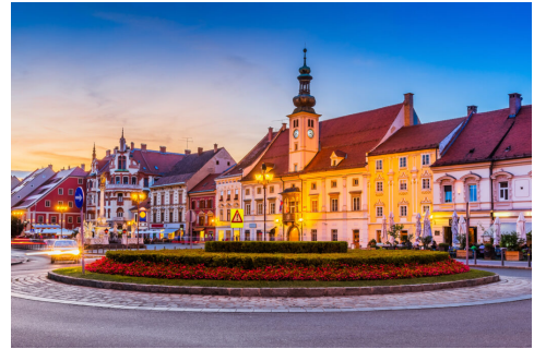
Town Hall on the Maribor Main Square, Slovenia ID 174146035 [/caption]