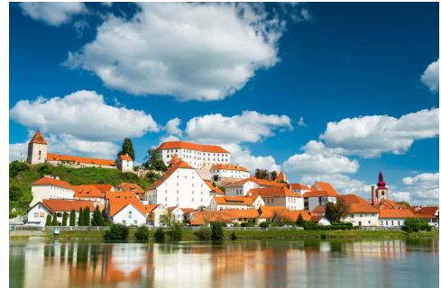
Ptuj Grad in Slovenia with Castle and Fortifications on the River Drava [/caption]