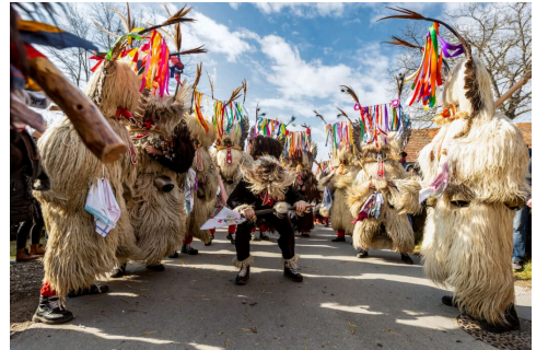
Ptuj - Kurentovanje: celebration of coming spring - Kurenti urging winter to leave by Aleš Kravos, CC BY-SA 4.0 < https://creativecommons.org/licenses/by-sa/4.0/ >, via Wikimedia Commons[/caption]

[caption id="attachment_22583" align="alignnone" width="800"]