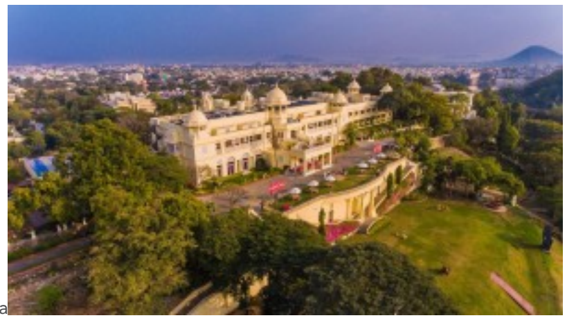
The 5 star Lalit La

The Mandir Palace in Maharawal's royal residence, is an exquisite example of the delicate construction and stone carving the city is known for; Castle Bijaipur is a fortress built by the brother of Rana Pratep of Mewar, one of the legendary heroes of the Rajput resistance; it stood against onslaughts of Mughal and Maratha armies; the Aodhi Hotel, close to the majestic fortress of Kumbhalgarh, was once a hunting lodge for the Mewar princes and is now part of the heritage chain of hotels owned by the current Maharana.