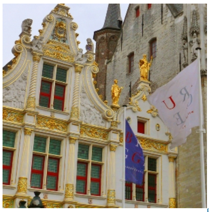
Beyond Chocolate and Windmills:

Cultural Treasures of the Low Countries with John Weretka 8 - 26 September 2016 & 7 - 25 September 2017