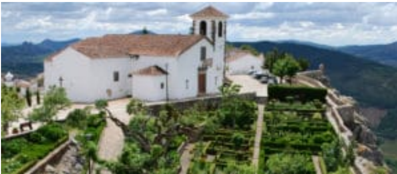
The Pousada de Marvão, Portugal.