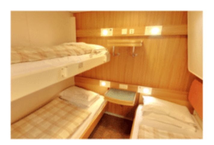
Inside 4-berth cabin

With two lower fixed berths and two pull down bunks accessed by a fitted ladder, these cabins are great for families and visitors travelling in groups. Please note – inside cabins do not have windows.