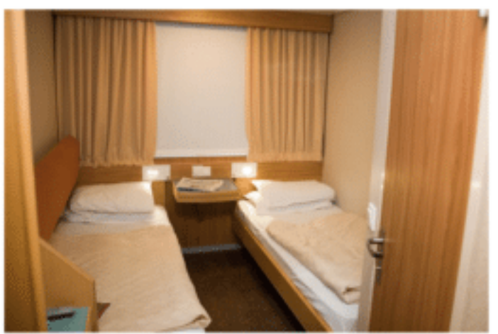
Cabin Outer Twin

A large window, providing natural light, gives a spacious feel to these cabins. They have two comfortable fixed beds, positioned side by side.