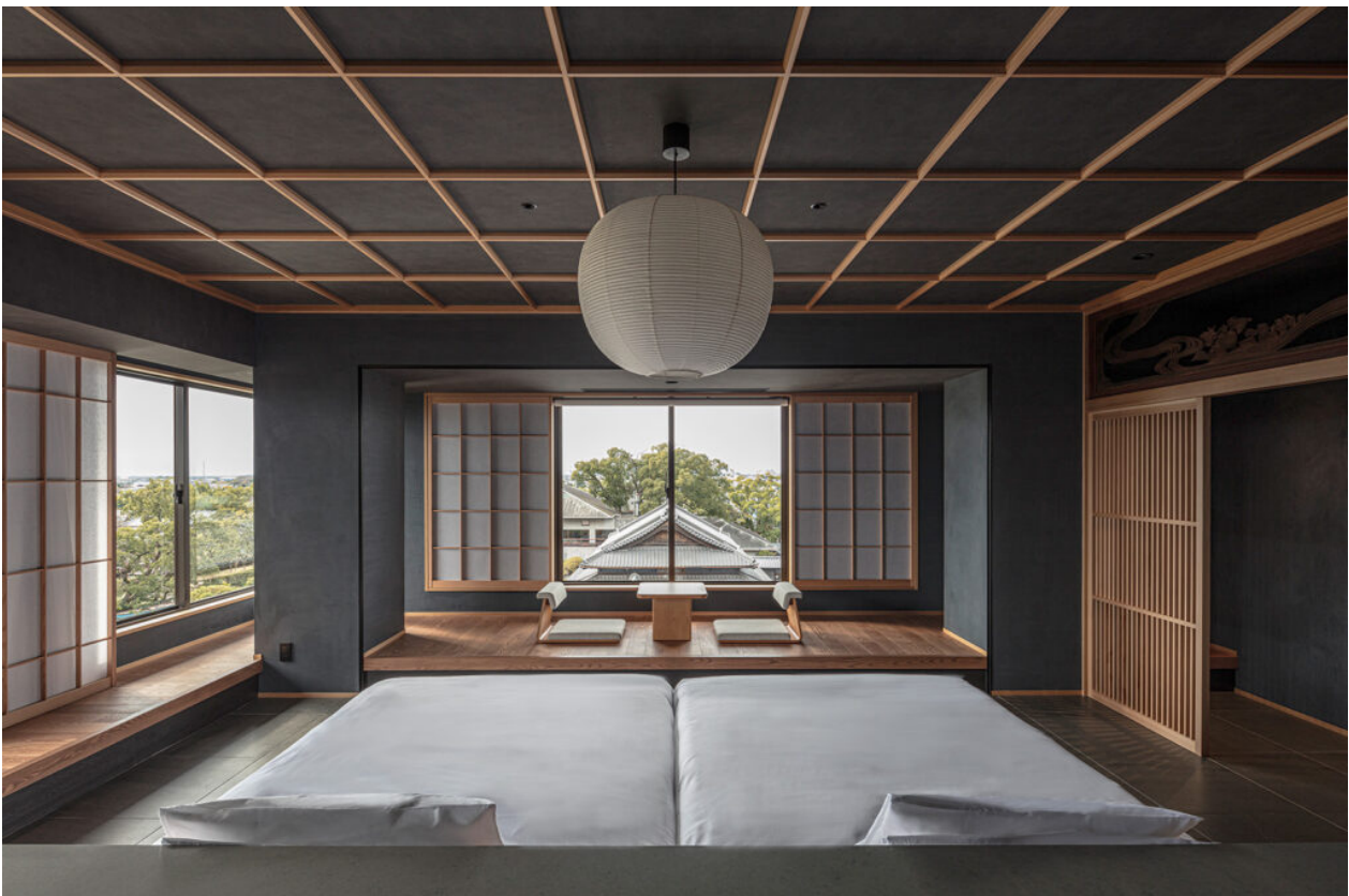
Image: Ohana Ryokan, Yanagawa, Japan

Payment of this supplement will ensure accommodation in a room for single occupancy throughout the tour. The number of rooms available for single occupancy is extremely limited. People wishing to take a Single Supplement are therefore advised to book well in advance.