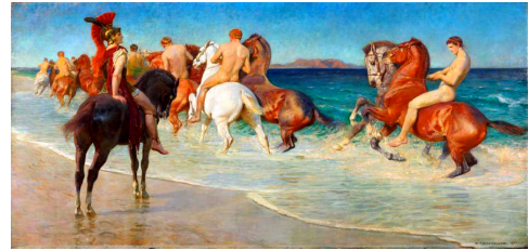
On the sea-beat coast, where hardy Thracians tame the Savage Horse by William Frank Calderon[/caption]

Similarly, Herodotus (Book V, II; Histories) wrote of the Thracian polity of the 5th century BCE: "The Thracian ethnos is the most numerous after the Indian. The Thracians are differently named in each separate region of their country, but the manners and customs of the whole nationality remain just the same everywhere in their rich lands."