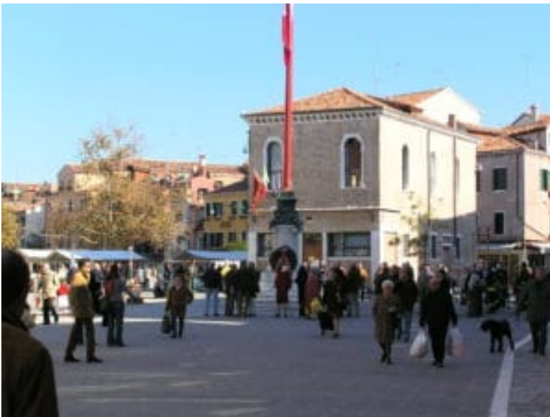
Mix with the locals in Campo Santa Margherita! (4 minutes’ walk from Avani Rio Novo Venice) Image from Wikimedia Commons

Double rooms for single occupancy may be requested – and are subject to availability and payment of the Single Supplement. The number of rooms available for single occupancy is extremely limited. People wishing to take this supplement are therefore advised to book well in advance.